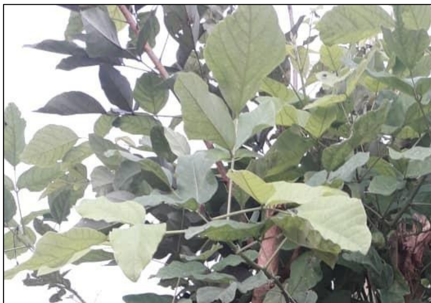
Figure 1: Photographie de feuilles de Erythrina senegalensis

Altitude: 134 meters. This plant was authenticated at the national floristic center of Cocody Félix Houphouët Boigny University in Côte d'Ivoire (Figure 1).